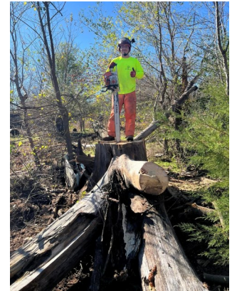
Local Chainsaw Crew working in Oklahoma after tornadoes

A message received this week regarding the Chainsaw Crews: Thank you for being willing to help our neighbors to the north. I'm sure they will return the favor, and we will be going back to help them. After talking with all the White Caps that served on this deployment, every one of them raved about the work our teams did. All of them were impressed with the abilities that our teams have, not only with a chainsaw, but with your witness. God is reaching out in many ways