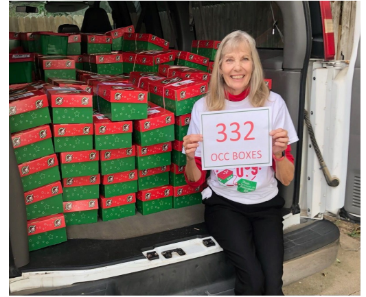
Bluff Dale Baptist surpassed goal of collecting Christmas Shoeboxes