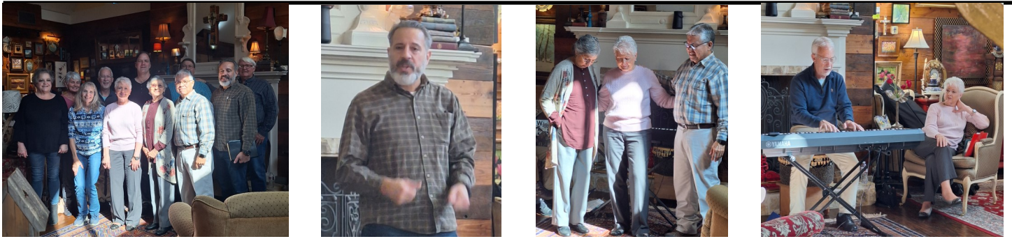
November 2024 Bi-Vocational Pastors & Wives Retreat