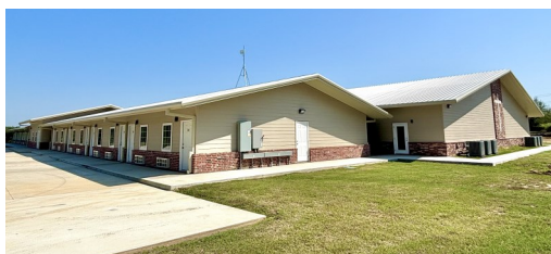
ADULT CONFERENCE CENTER & ROOMS