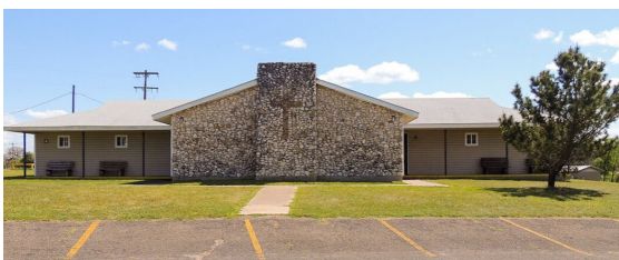
ONE OF THE YOUTH CABINS